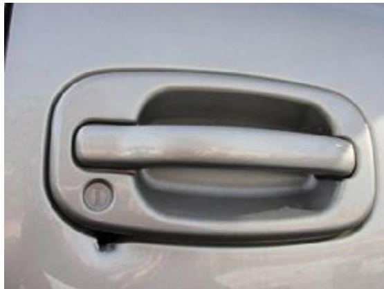
Thanks to Dave Ewing

Here is a picture of what the hole looks like: