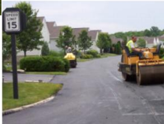
"After a decade of waiting, Lark Lane has a new surface"

After a decade of waiting, Lark Lane has a new surface. June 15, 2011 is a red letter day for those residents whose drives open onto Lark Lane. Gone are the days of bumpy rides and dodging defects in the concrete surface. The contracted construction company repaired many of the serious defects in the concrete before adding about 3" of black top to the entire