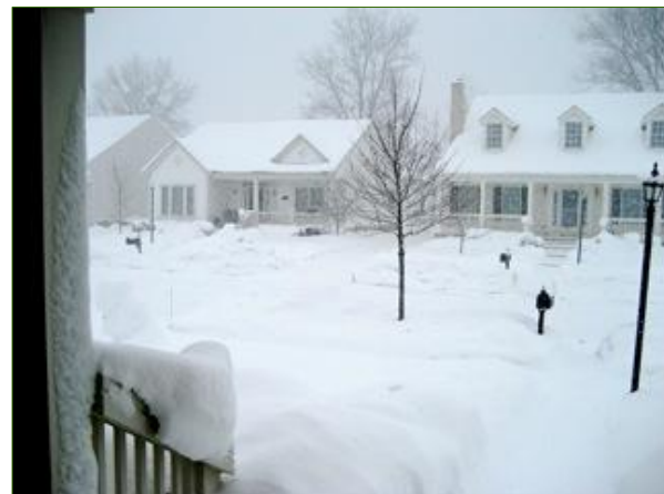
The Blizzard of Feb '10 dropped lots of snow in New Albany